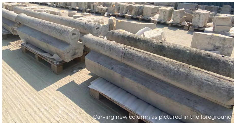
Carving new column as pictured in the foreground

Colin has been with USL since 2011 and is instrumental in leading the stone masonry department.